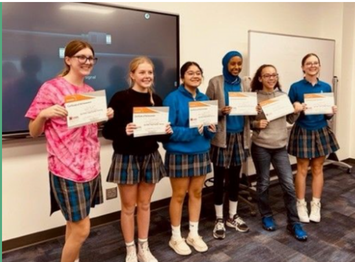
Food Safety & Nutrition Program $1,000 for a food safety training pilot program for five urban high schools. Trained 200 high school students with National Restaurant Certification class. Students received a Food Handlers certificate that is good for two years in the U. S.