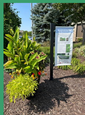
Village Pointe bee hotel, garden and sign