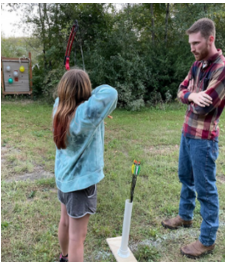
4-H Youth Development Programs Springfield Blue Jeans and Boots 4-H club - $892.00 for an archery project. Received a shooting sports grant to get some archery equipment so more kids in our club can try and join in shooting arrows. 3 bows and arrows were purchased.