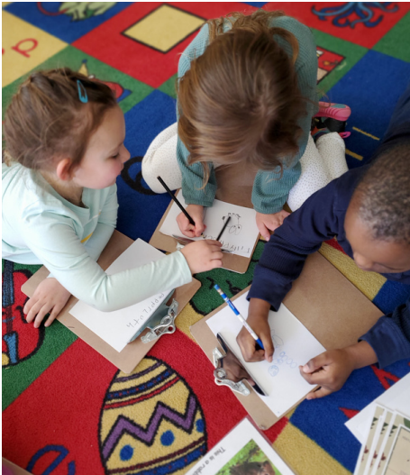
Early Childhood Extension Program $1,000 for outdoor play program.