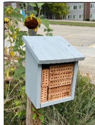
Josie Harper Hospice House