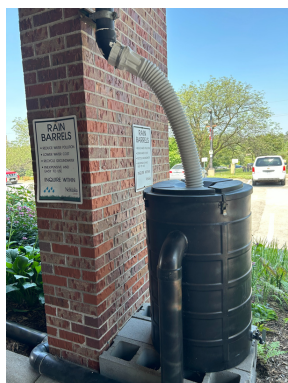
Chuck Blanchard Memorial Garden rain barrel

This pas year, we have provided $1,887 to 12 teaching gardens for plants and gardening supplies around the counties.