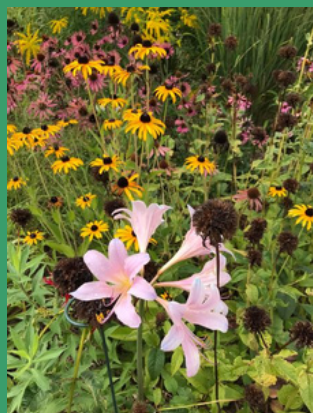
St. Leo's pollinator garden